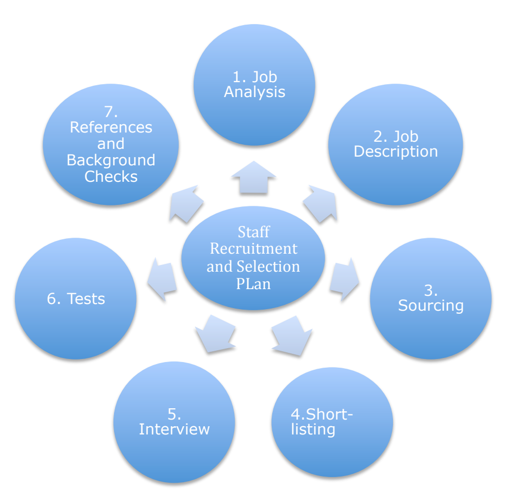
Figure 4.1: Staff Recruitment and Selection Plan

The proposed plan is in two in parts that is the recruitment process and methods and selection process and methods. The recruitment process is the first process followed by the selection process. Appendix 3 shows a flow chart of the process of staff recruitment and selection. The procedures, are outlined in Fig 4.1