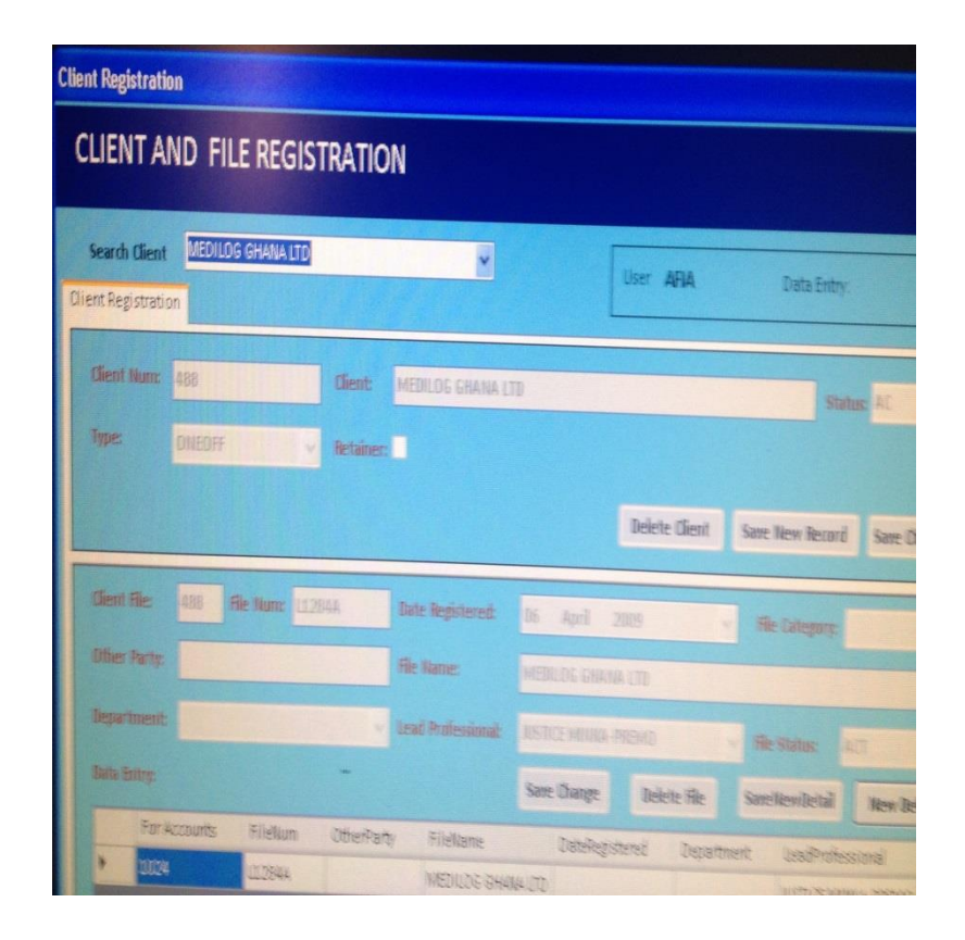
Figure 1: Image of database registration form from Minka-Premoh & Co.

2. Oxford and Beaumont Solicitors: This firm has been in existence for seven years; O&B is high on the level of technology use and has sixteen lawyers. The lawyers at this firm are much younger than Minkah-Premo & Co. This law firm has one in-house IT person who ensures that the information technology of the firm is working properly. This firm also has an in-house email system, using Outlook. This firm also has a data management system that keeps documents and records of people who have worked on a file. This system saves the files and helps one find them easily. Oxford and Beaumont also uses Legal Aid. This software tracks billable hours, pulls out time sheets and converts them into invoices after a lawyer or a paralegal has worked on a case.