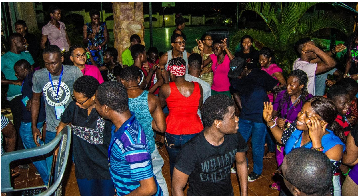
Fig 2. Picture showing Ashesi students across all year groups socializing during 2017 Akwaaba night.

Five respondents mentioned that the Akwaaba night is a realization of a new stage and gives a sense of belonging making most first-year students to patronize it. This shows that organizational skills in events management applied by the planners provide a sense of belonging as it blends in the freshmen with the rest of the students' body. As the name suggests, Akwaaba night, which means welcoming night draw first-year students to the event, which is aimed at making them have the feeling of belonging to the larger Ashesi community. The international students attest that the Akwaaba night experience made them have a sense of belonging in the new environment.