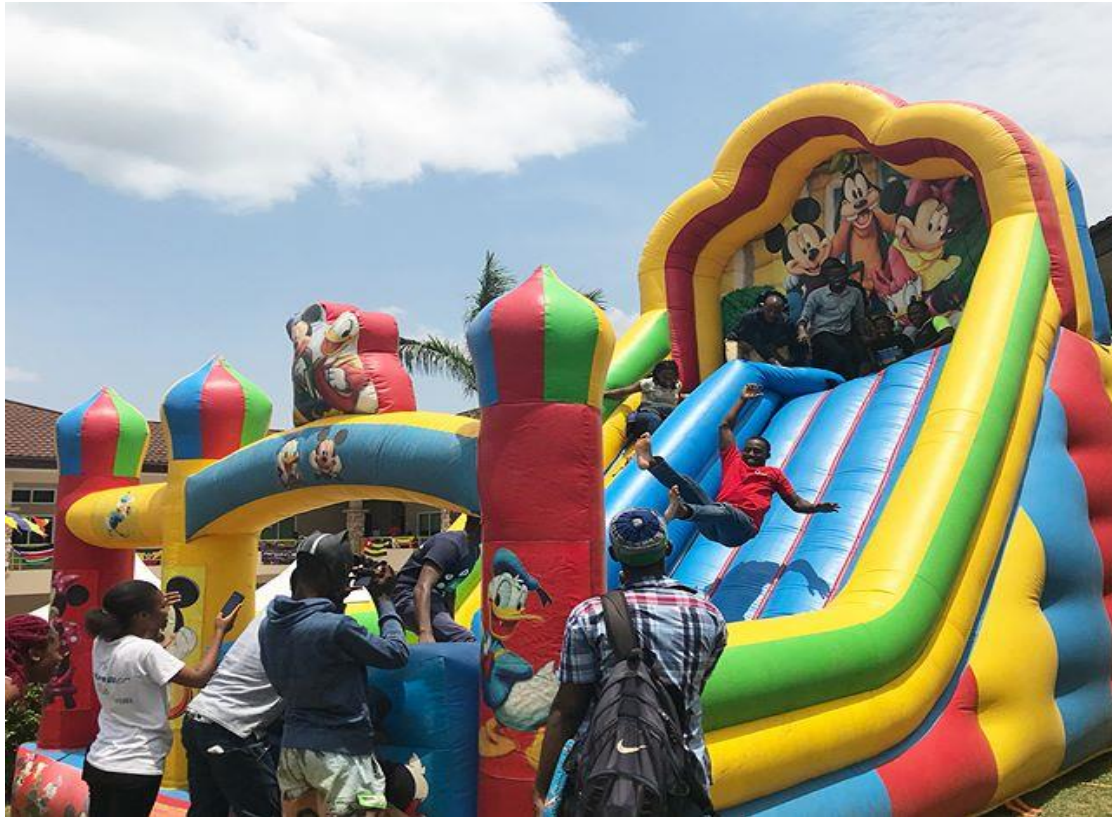
Fig 3. Picture showing Ashesi students playing games in between classes during 2018 ASC week crazy day.

Results show that the year group with the highest number of ASC executives tend to be frequent attendees of the ASC events. Surprisingly during the second semester of the 2017/2018 academic year, the class of 2021 is more active yet it's the class of 2019 in the executive positions.