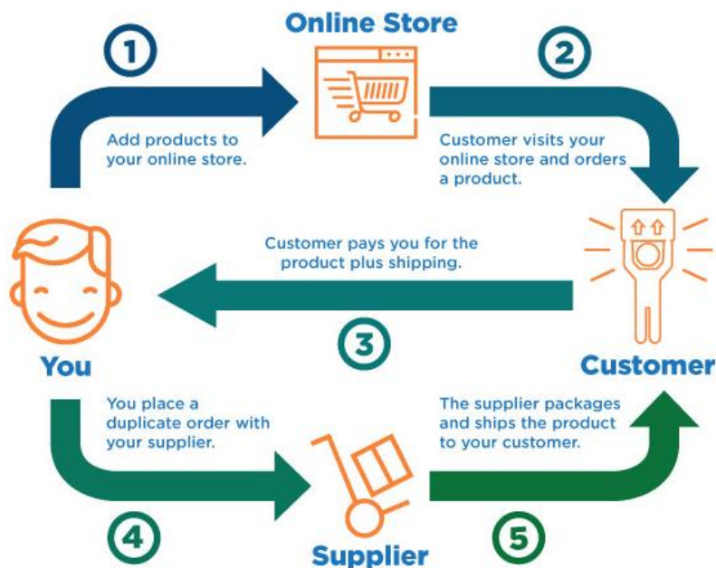
Figure 2. Dropshipping model