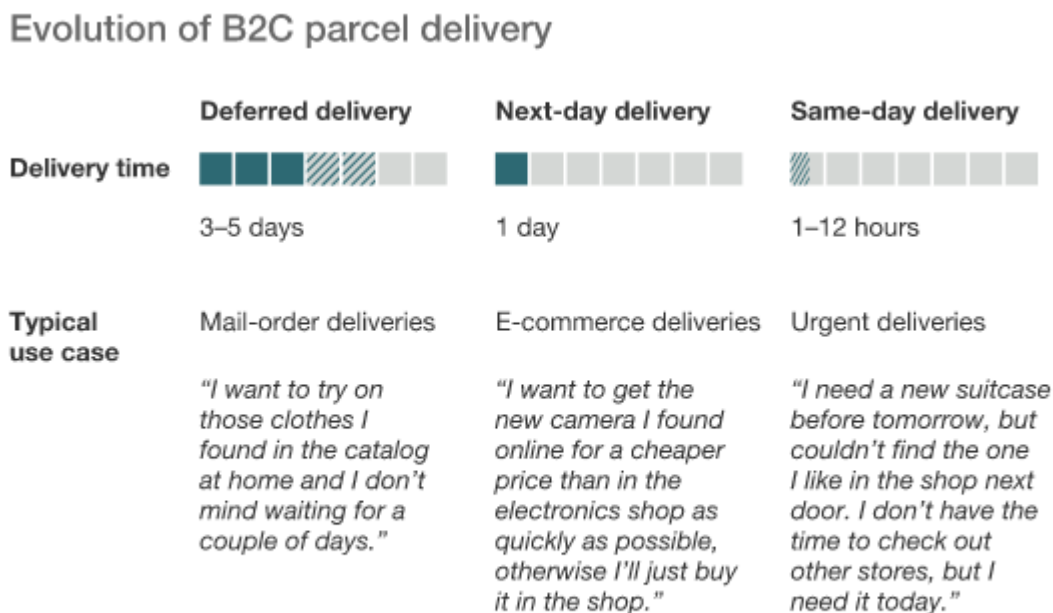
Figure 1. Evolution of B2C parcel delivery

This model is the most common model in the online retail industry, where online shops deliver products to consumers to their homes directly, or to their desired drop-off point. Over the years, the direct delivery model has evolved into three sub-models: deferred delivery, next-day delivery and same-day delivery (Hausmann et. al, 2014). The diagram below illustrates the three sub-models: