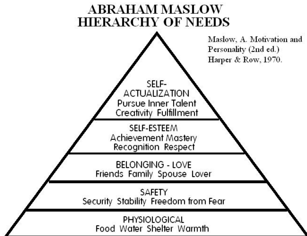
Figure 1: Maslow's hierarchy of human needs. (Adapted from Maslow, A. (1970).

This theoretical framework proposed highlights the view that in the hierarchy of human needs 'belonging' is an essential and prerequisite element that should be met before one could ever achieve a sense a self-worth. This framework highlights five levels (in ascending order): Physiological, Safety/Security, Belonging/Social Affiliation, Self-Esteem and Self- Actualization, as the five levels that determine an individual's level of belonging in the society. The framework shows the priority needs that all have to be satisfied; in ascending order before an individual feels like they belong. This framework was adapted in this work to show how the different levels proposed by (Maslow, 1970) helps us to further understand the level of inclusion for children with special needs in Ghana. Fig 1.1 is the diagram of the theoretical framework: